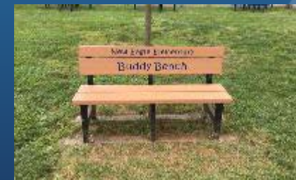
Gift to School