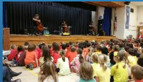
Cello Fury Concert