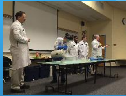
JM Science Presentations