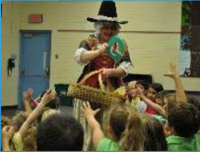
Mother Goose Storytelling